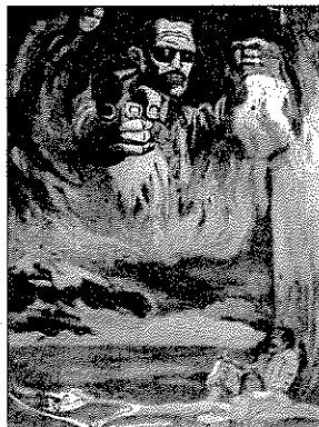
Novel Cafe, 212 Pier Ave., Santa Monica. Birds Cafe, 5925 Franklin Ave., Hollywood. www.elgato.com .