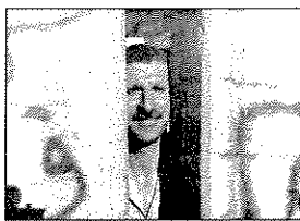
Man in the "Wall."

Though Bitton interviews both Israelis and Arabs, none of her subjects has been personally affected by the terror attacks that caused the wall to be built in the first place.